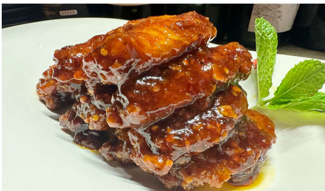
干烹鸡翅 Princess Chicken Wings