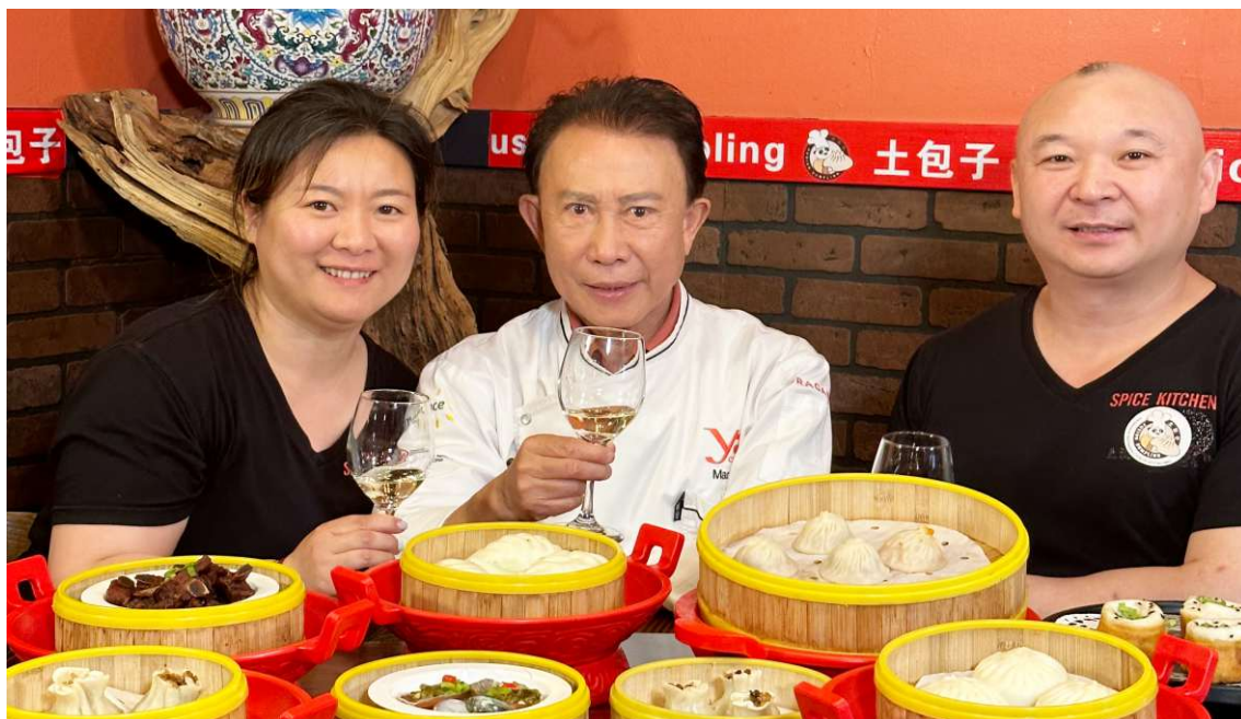
Chef Martin Yan's favorite restaurant for dumplings. (Photo with restaurant owners)