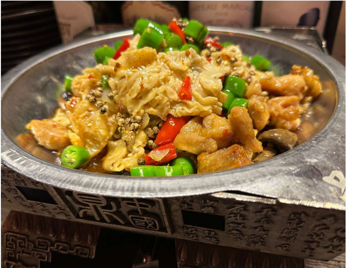
香锅花胶鸡 Chicken And Fish Maw w/Flaming Pot