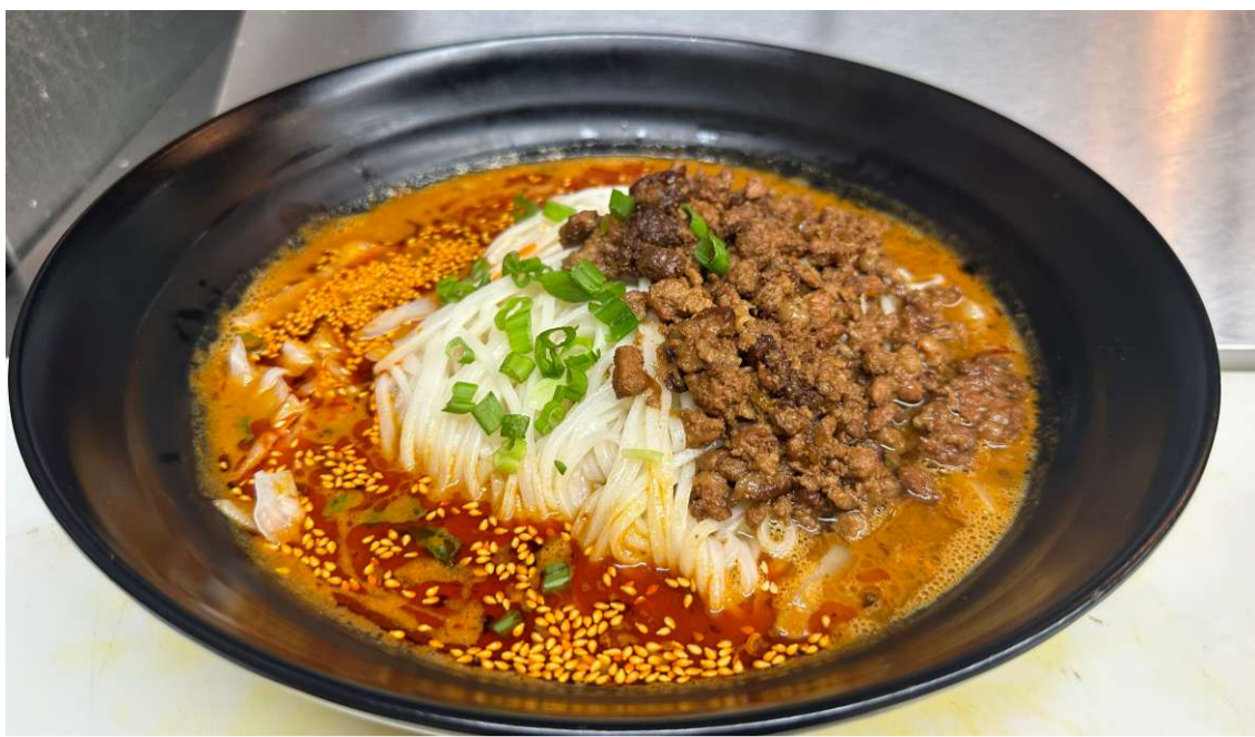
担担面 Tan Tan Noodle