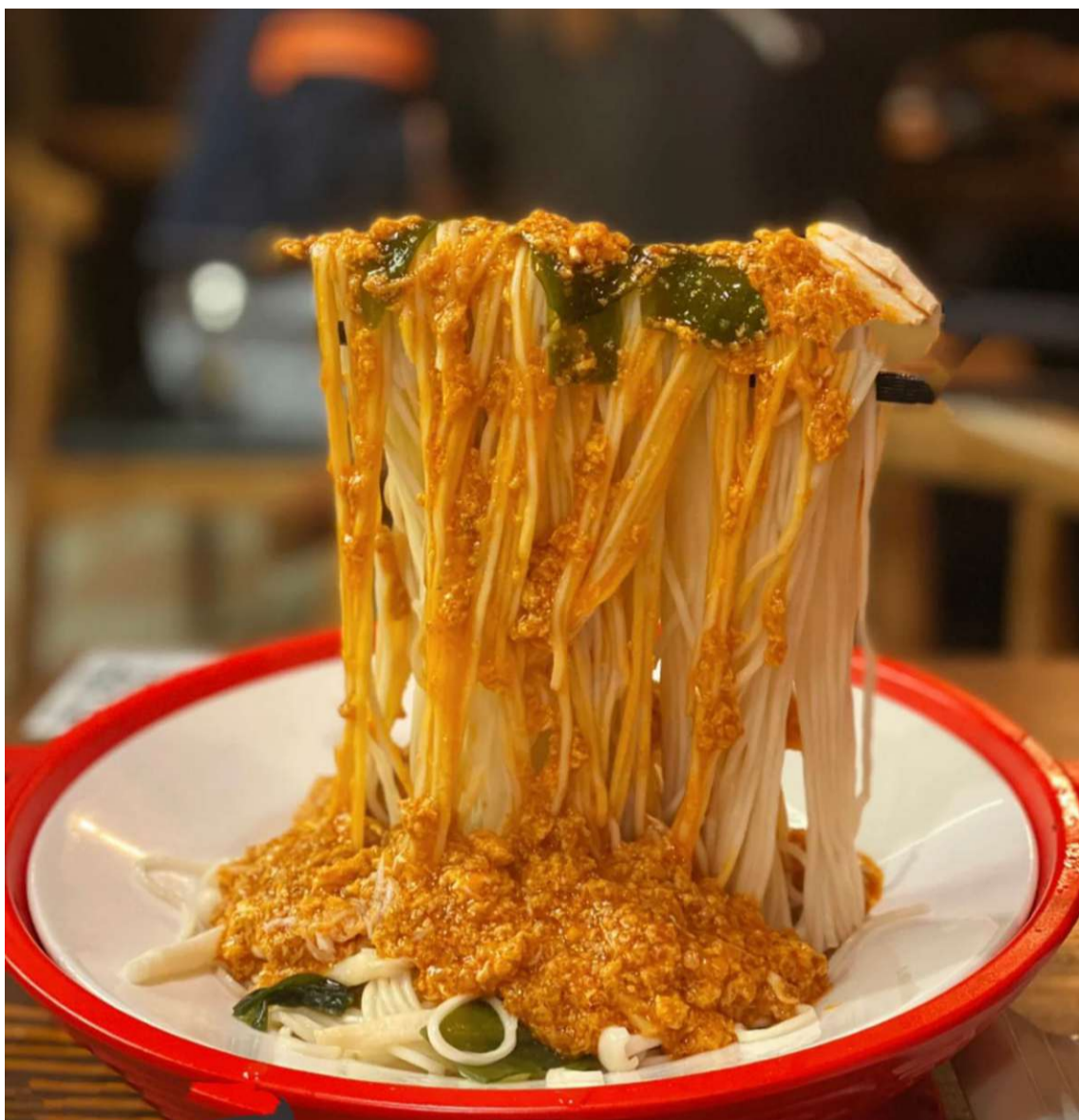
网红蟹肉皇捞面 Crab Meat Lomein