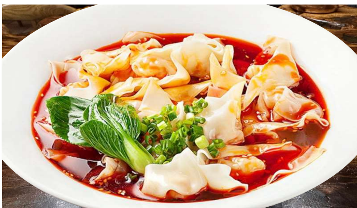
红油抄手 Spicy Wonton w/ Chili Oil