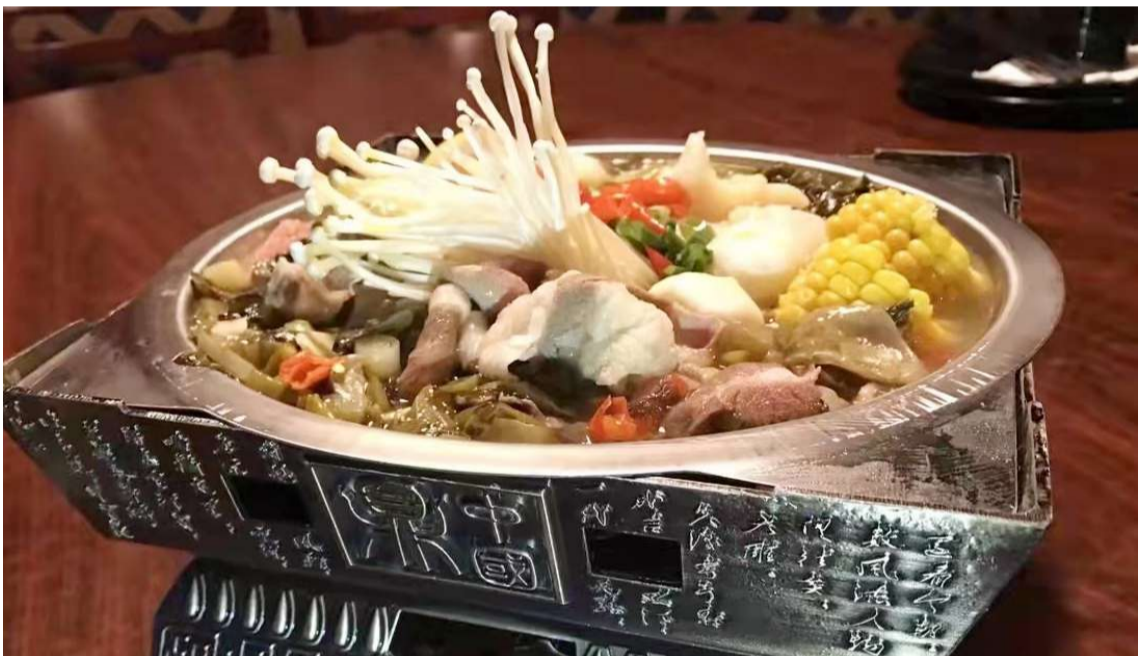
迷你什锦小火锅 Mini House Combo Hot Pot