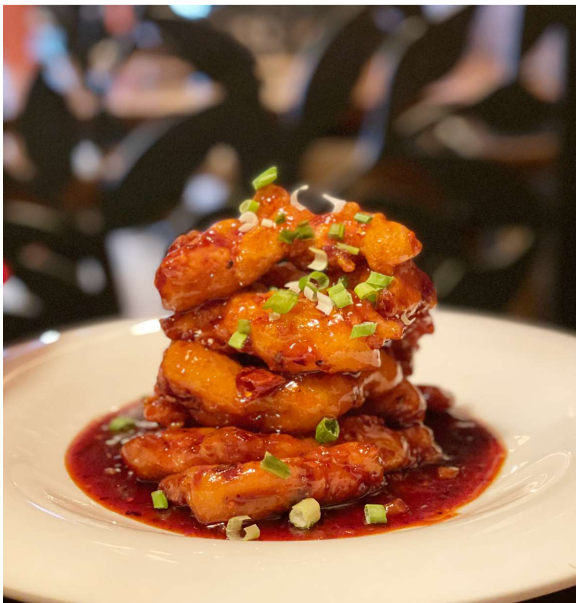
左宗棠鸡 General Tso's Chicken