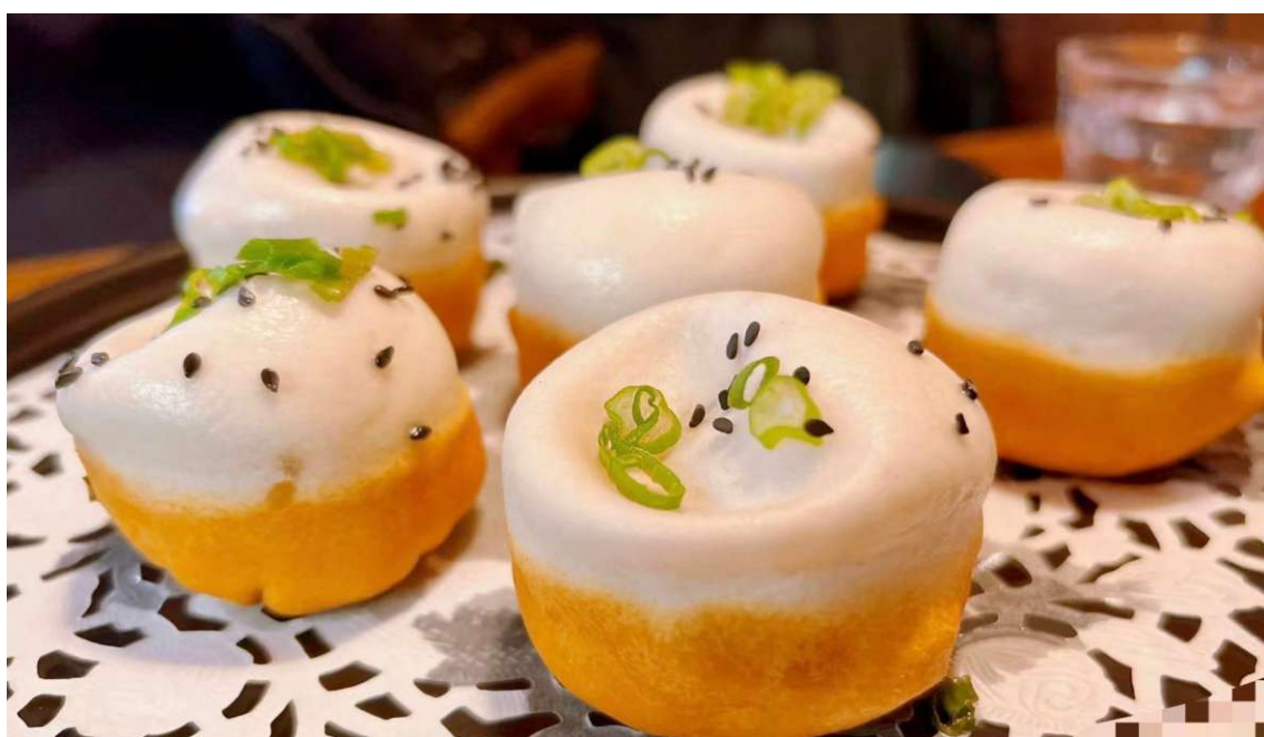
猪肉生煎包 Pan-fried Pork Soup Bao