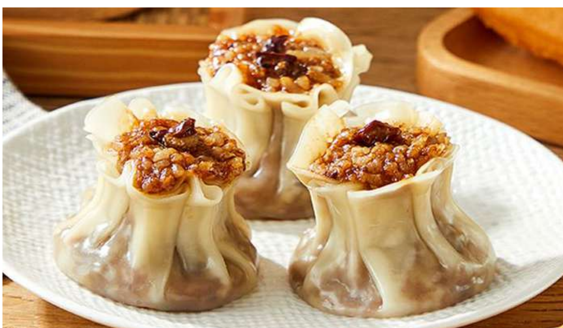
上海糯米烧麦 Shanghai Sticky Rice Shumai