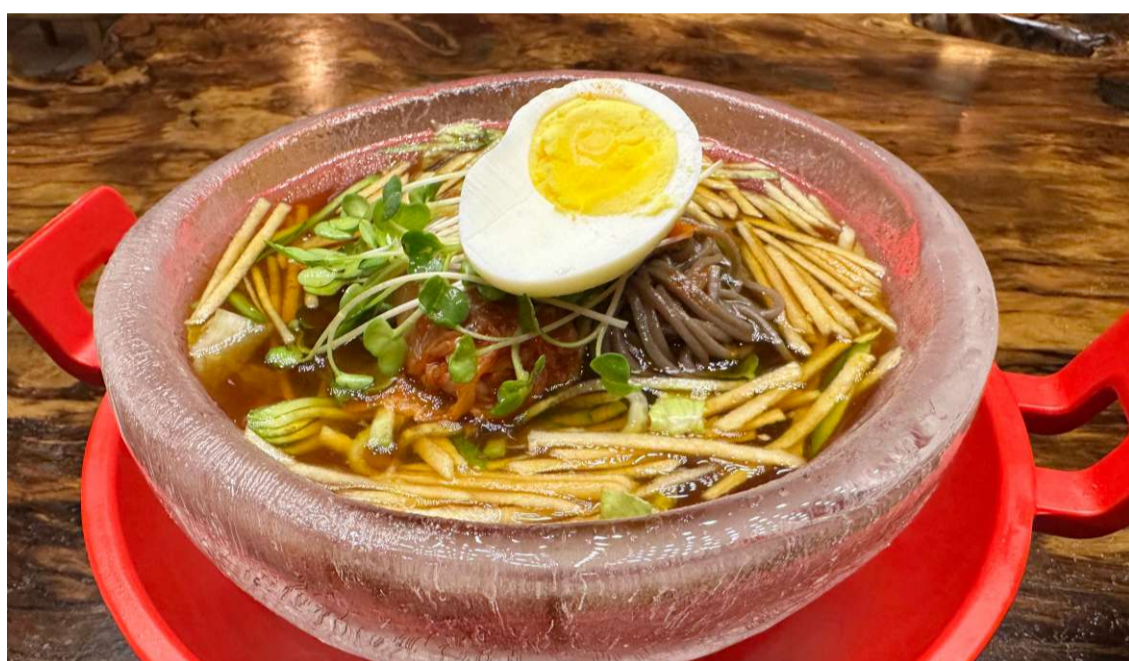
网红冰碗大冷面 Special Cold Bowl Noodle