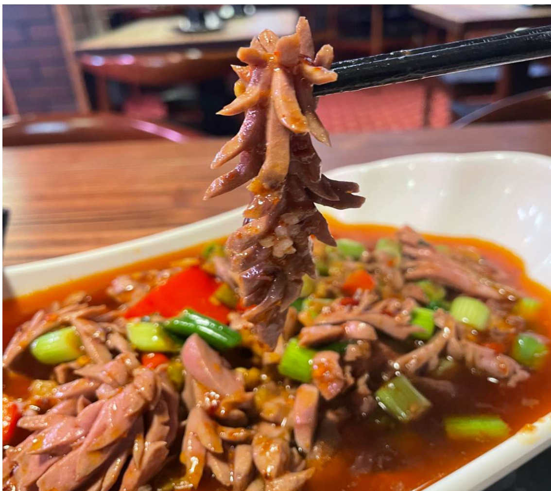
火爆腰花 Flaming Spicy Kidney