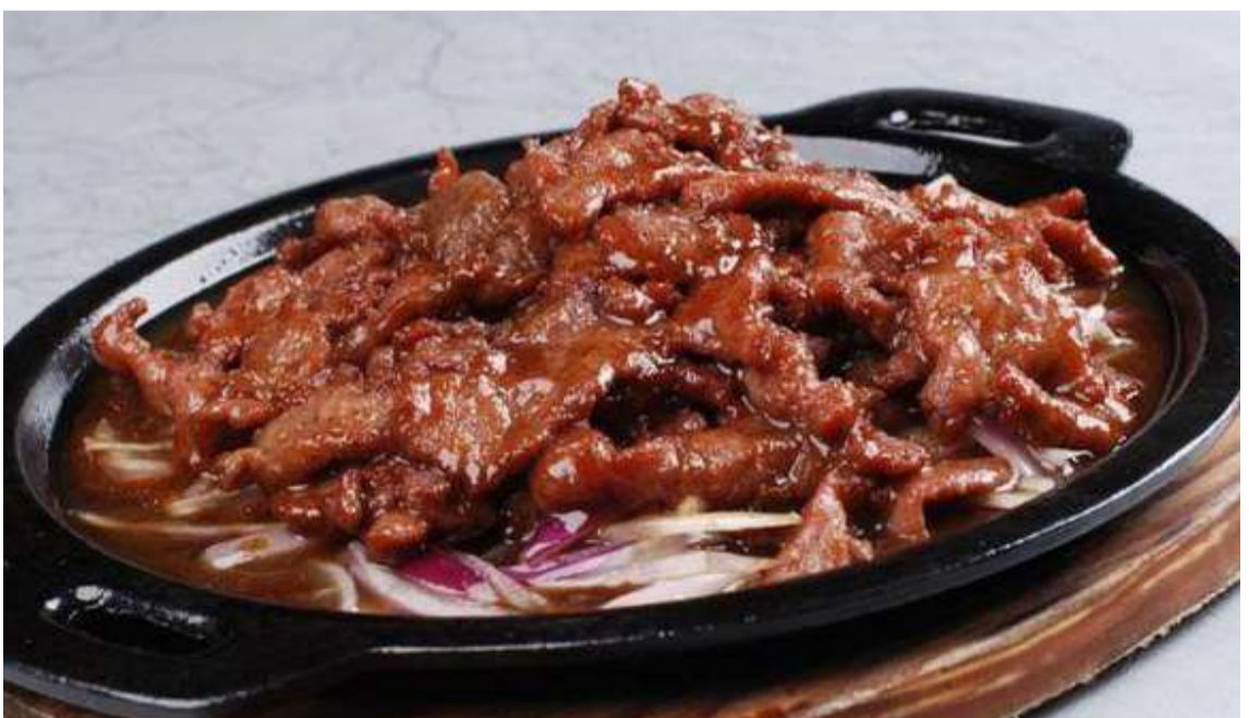
铁板黑椒牛肉 Black Pepper Beef w/Sizzling Plate