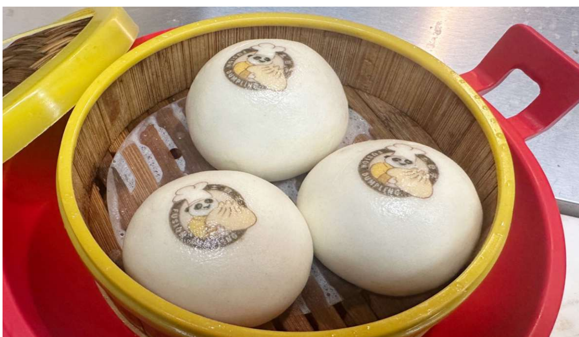
黑芝麻包 Black Sesame Bao (Sweet)