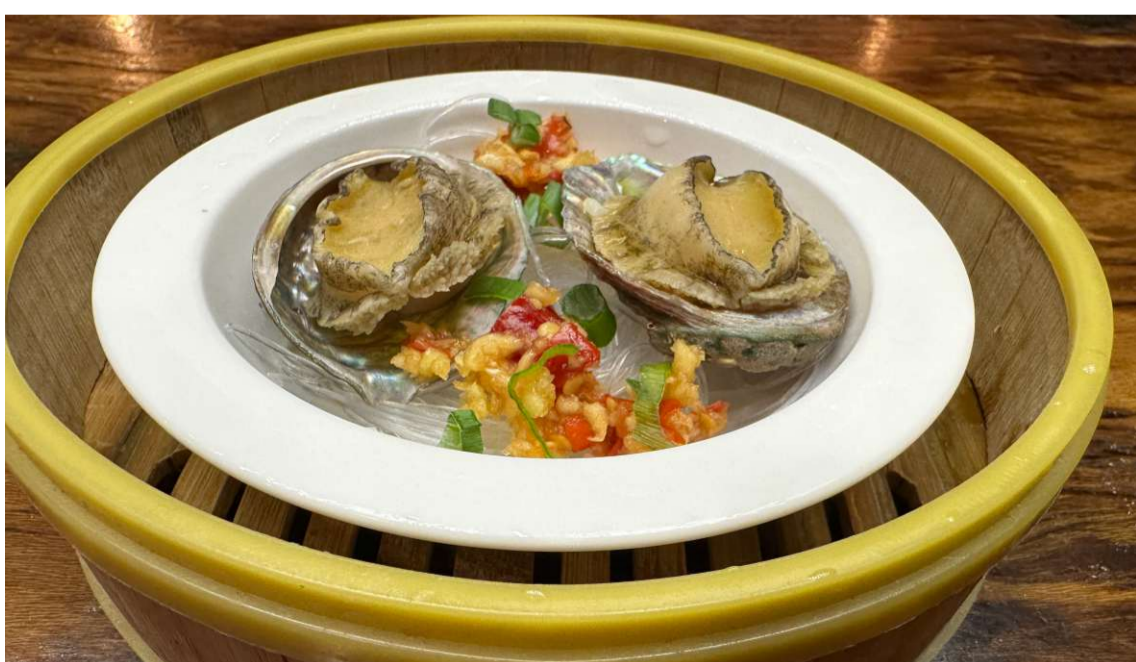
蒜蓉蒸原壳鲜鲍 Steamed Garlic Abalone