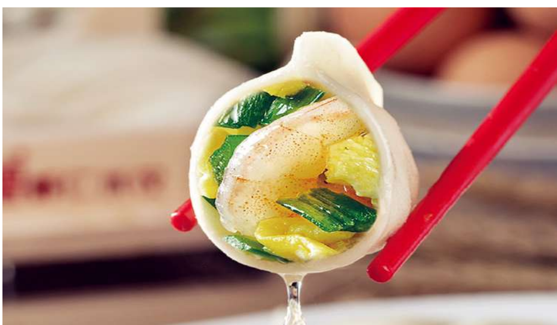
黄瓜虾仁水饺 Shrimp And Cucumber Dumpling