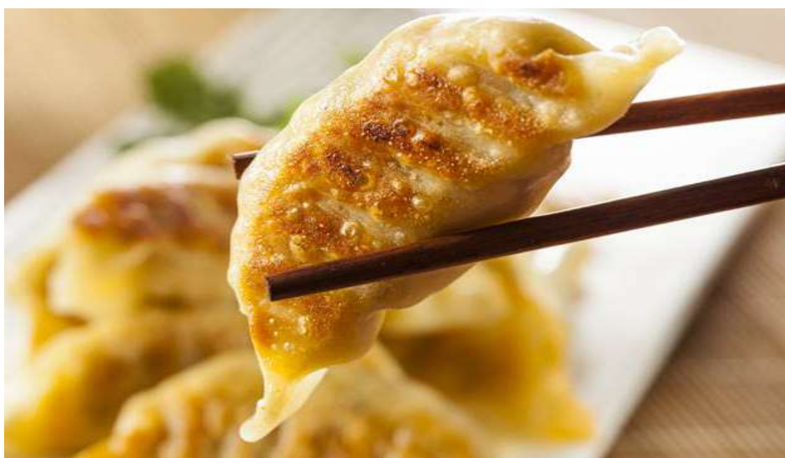
北京烤鸭锅贴 Peking Duck Pot Sticker