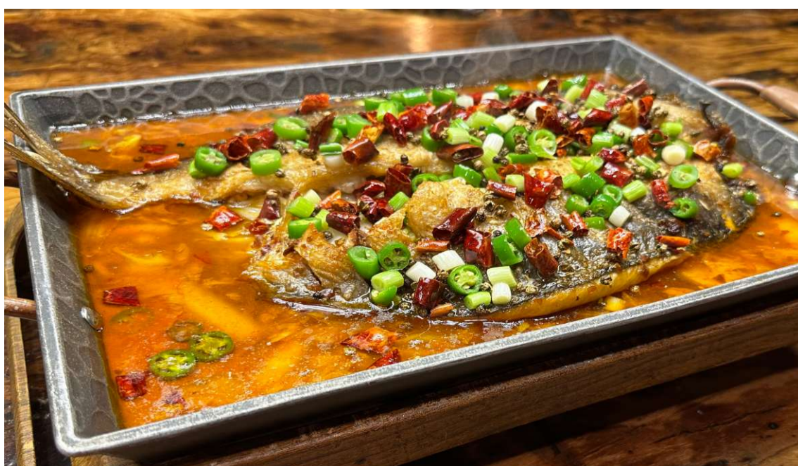
烤活鱼 B.B.Q Whole Fish