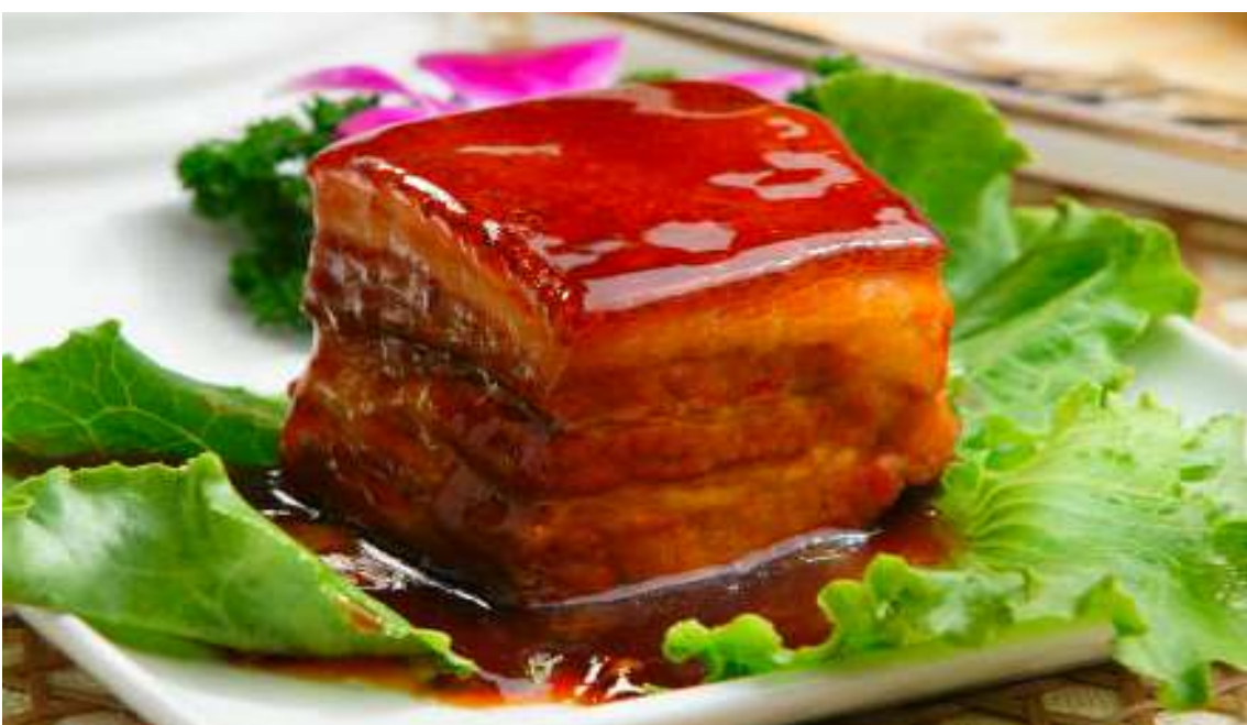
秘制东坡肉 Dong-po Pork Belly