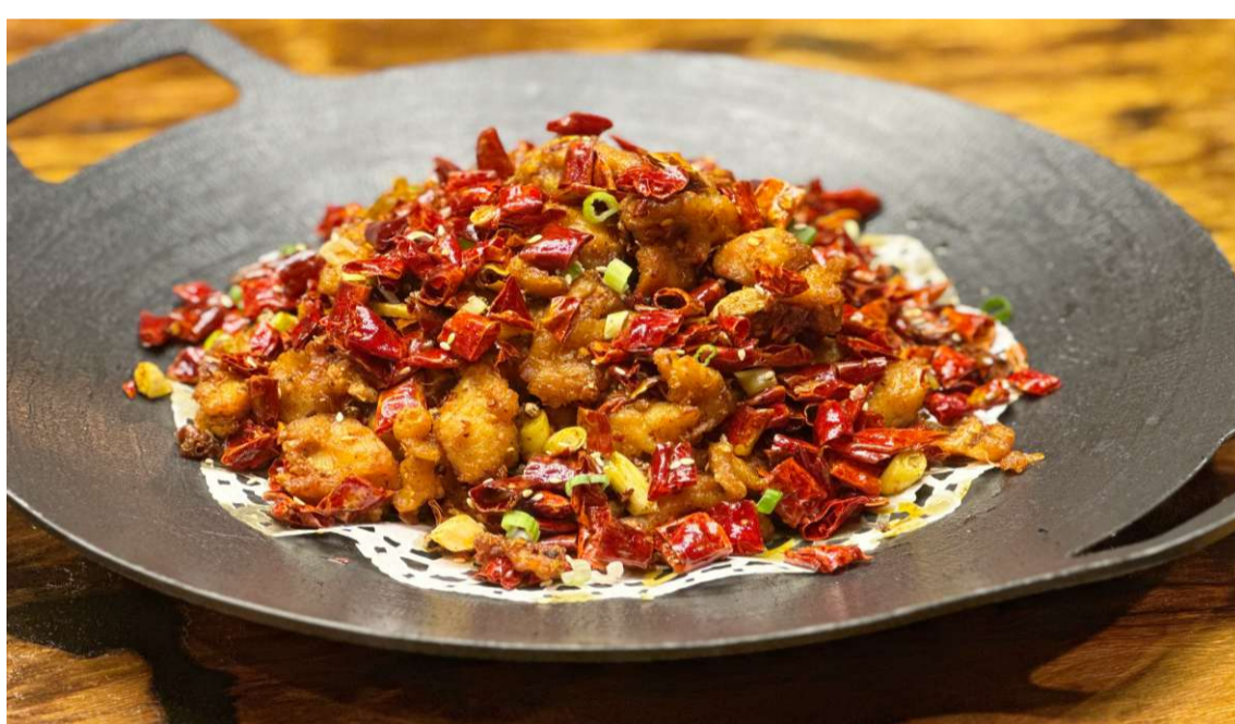
重庆辣子鸡 Chicken w/ Explosive Chili Pepper