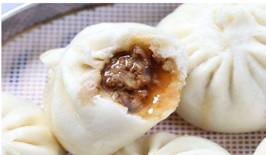
酱肉包 Braised Pork Bao