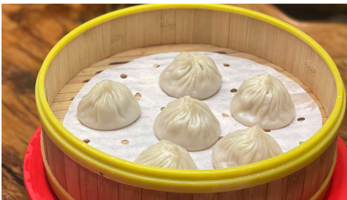
鲜肉小笼汤包 Pork Soup Dumpling (XLB)